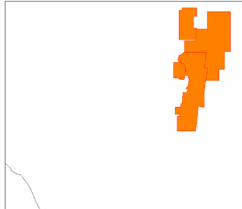
Imagery area (130 km2) Orange