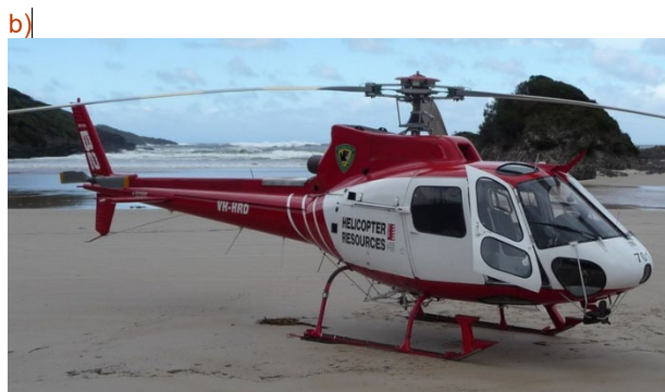
Figure 1: Examples of geophysical survey aircraft, a) Cessna 210 fixed-wing aircraft and b) Airbus AS350-B2 helicopter.