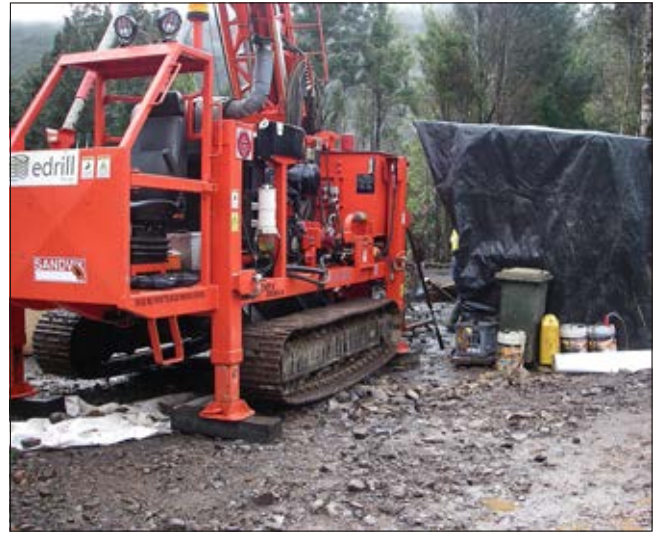
Drill site. Note oil absorbent matting under the rig.