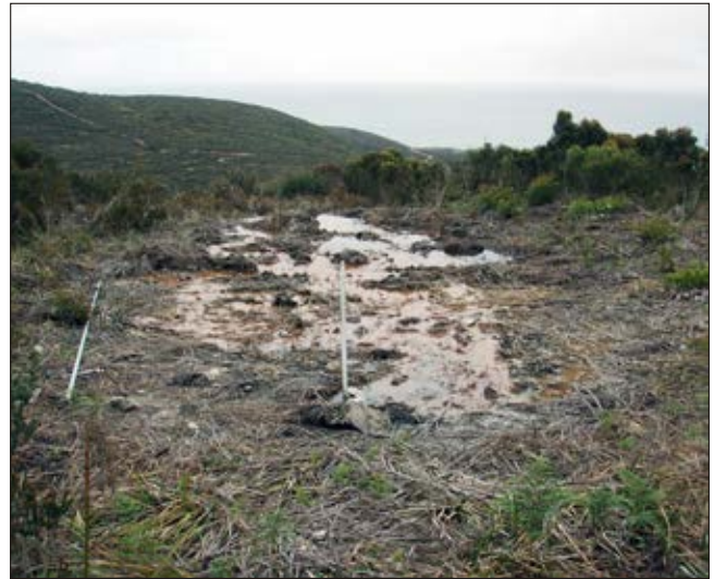
Attempts to seal hole failed because of poor collar.