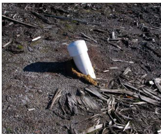
Solid PVC collar and cap — no number.

(left) Solid PVC collar and cap. Marked by treated pine pole, number will fade.