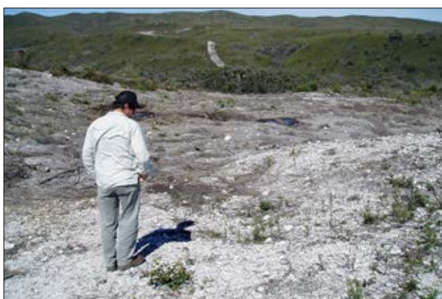
Balfour — Jute mesh site, 2005.