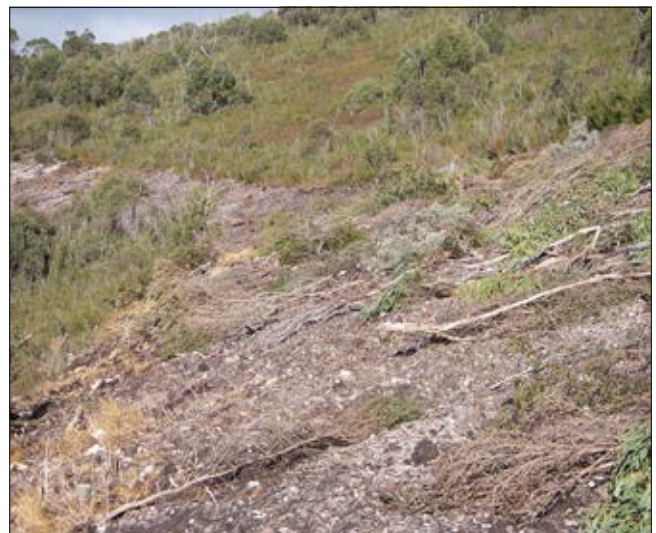
Tea tree and eucalypt slash.