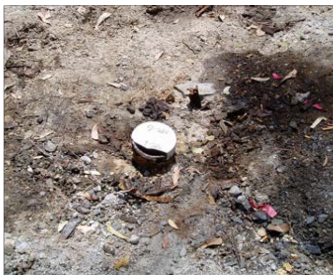
Broken PVC cap on steel collar.

(left) Solid PVC collar and cap. Marked by treated pine pole, number will fade.