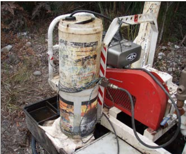
Poor bunding (filling with water) and jury rigged fuel supply to pump.