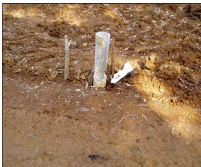
Smashed unsealed PVC collar.