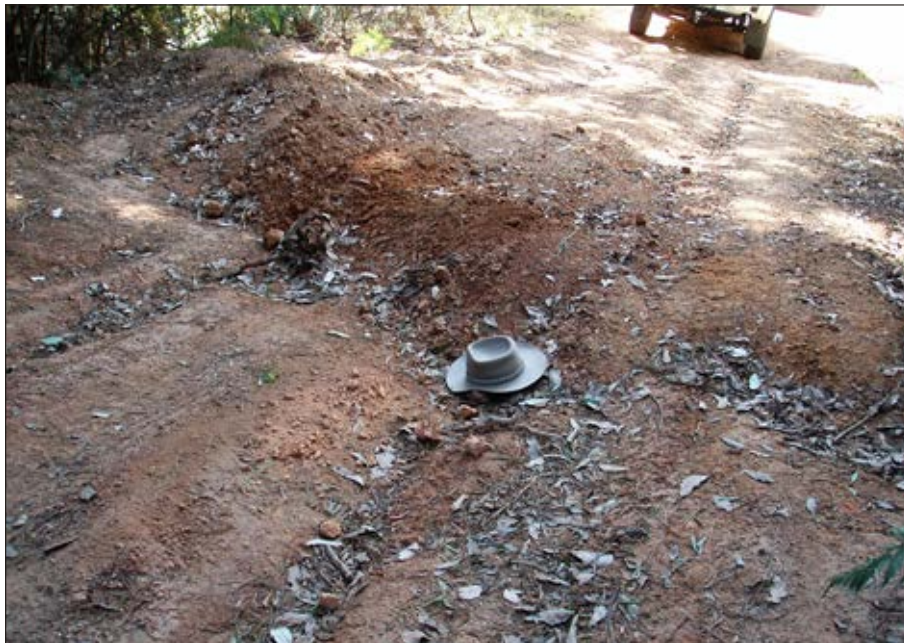
Angled grip, approximately 0.6 m wide and 0.3 m deep.