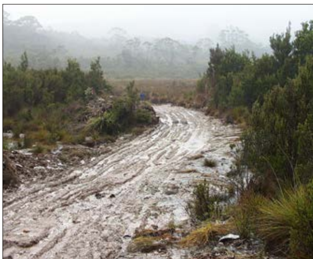
Drill track in use.