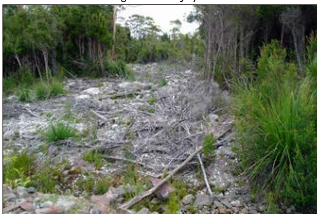
Track rehabilitation — February 2006.