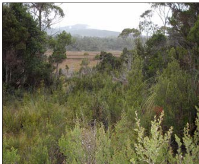
Drill track ten years after rehabilitation.