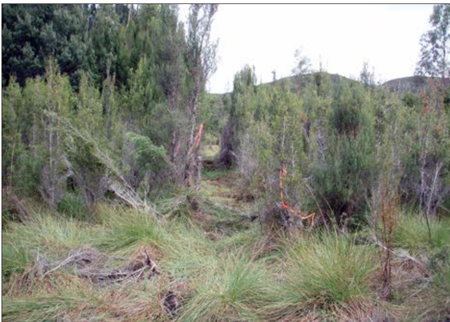
Grid line showing width and removal of trip hazards