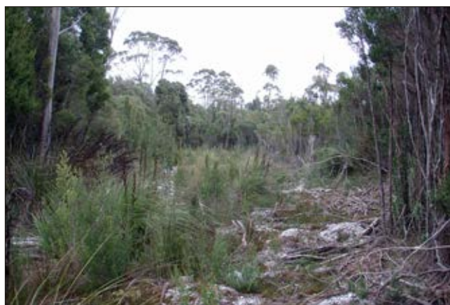
Track rehabilitation — October 2010.