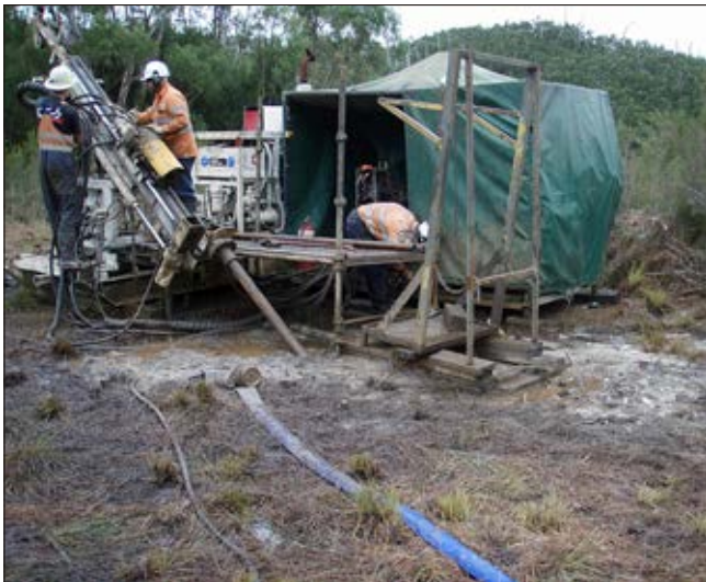
Flat remote area showing difficulty of draining drill water.