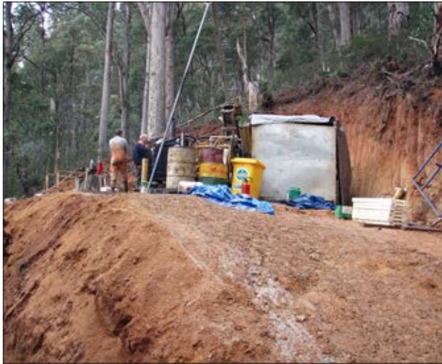
Drill site rehabilitation at Lorinna — July 2007