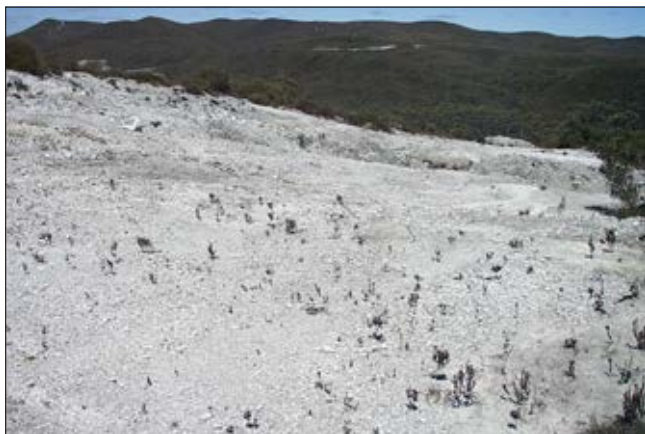
Balfour — Jute mesh site before spreading, 2002.