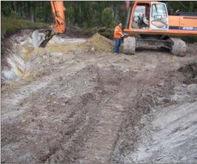
Drill site preparation — note drainage on top side of the pad.