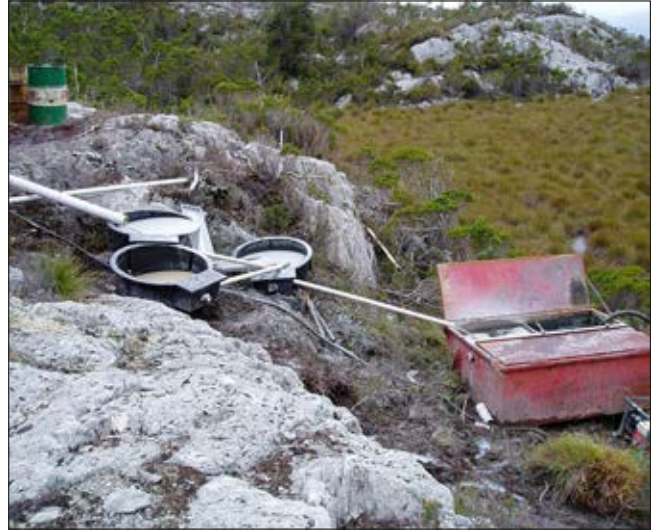
Remote area sumps that are working.