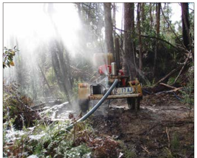
Water spraying from pump and fuel tank with no bund — very poor practice.