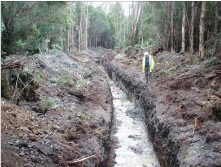
Costean at Stanley Reward showing topsoil to right and gravel to left.