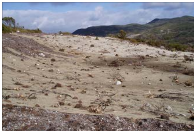
Balfour — Jute mesh site soon after spreading, 2004.