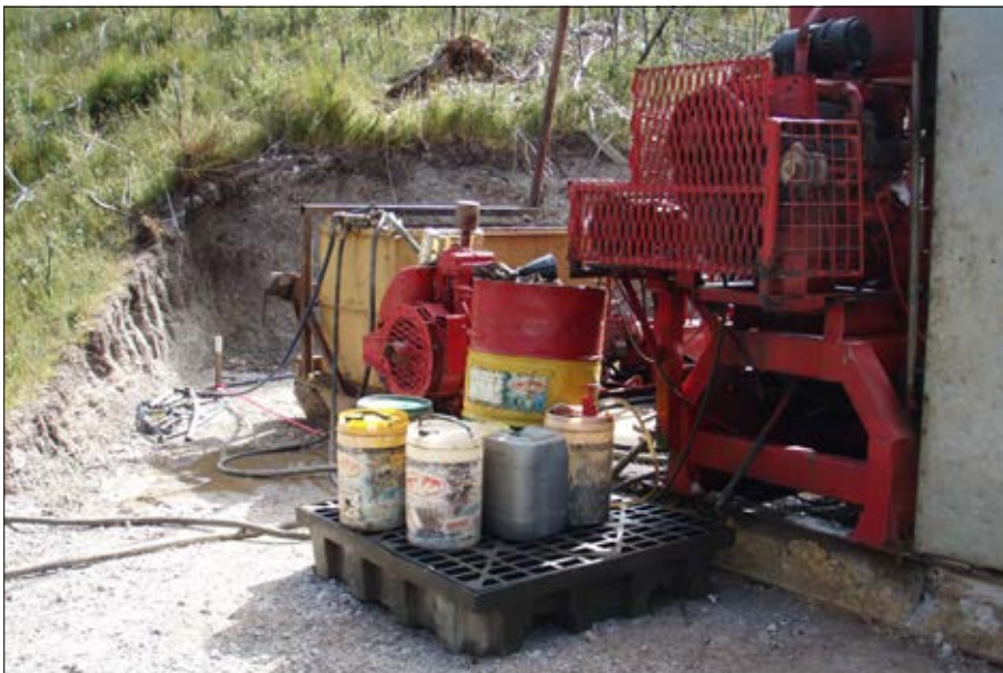
Bunded hydrocarbon storage — but no tarp or roof cover.