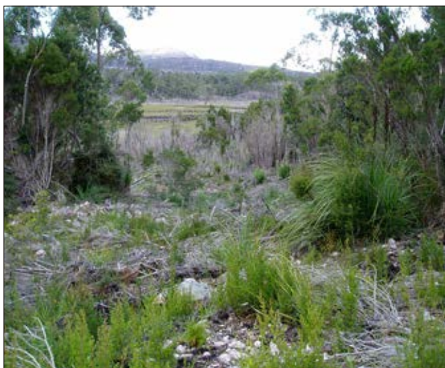
Drill track four years after rehabilitation.