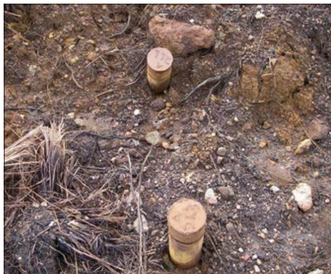
Steel collars — secure, sealed and permanent welded number.