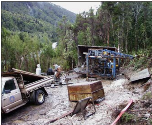
Drill site rehabilitation adjacent to Jukes Road — July 2001