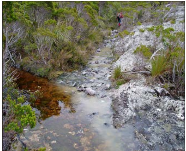
Creek contamination from drill water.