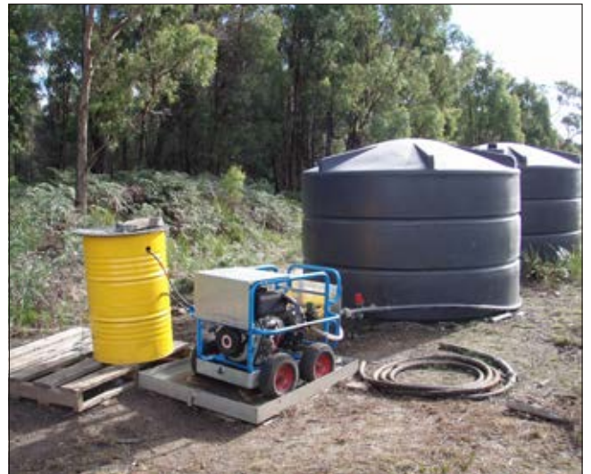
Excellent fuel tank setup contained within the yellow drum which acts as the bund.