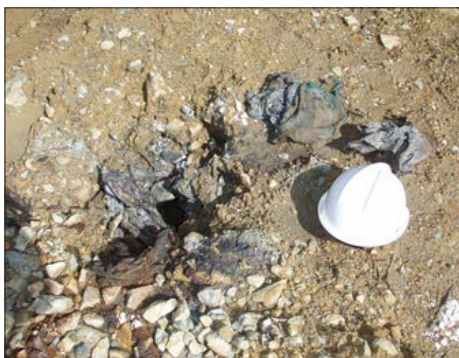
Open hole jammed with grease-soaked rags.

Refer to the chapter on Rehabilitation and Revegetation for timing, seeding rates and details on fertiliser types to be used in rehabilitation.