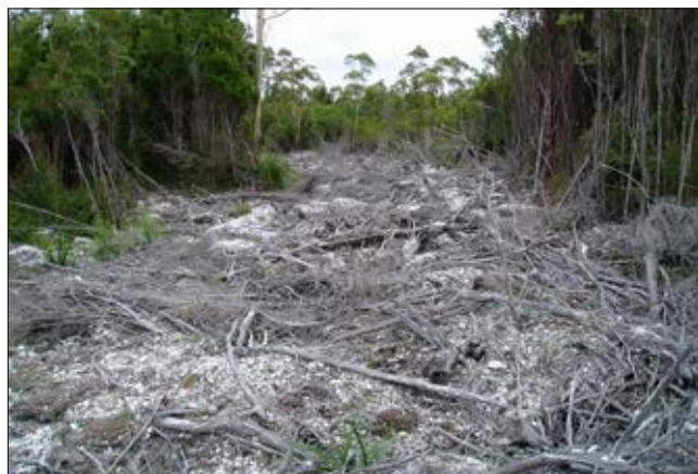
Track rehabilitation — January 2003.