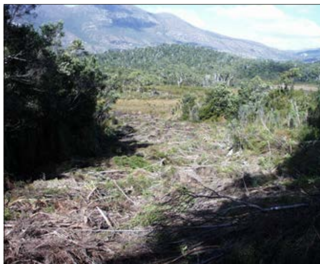
Drill track soon after rehabilitation.