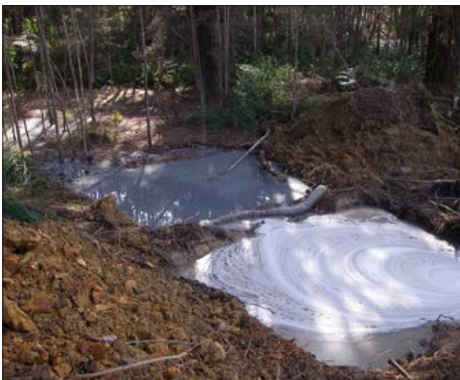
Dual excavated sump (above) and triple excavated sump (right).