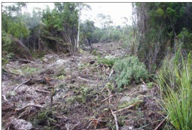
Track rehabilitation using stored topsoil and vegetation — July 2001.