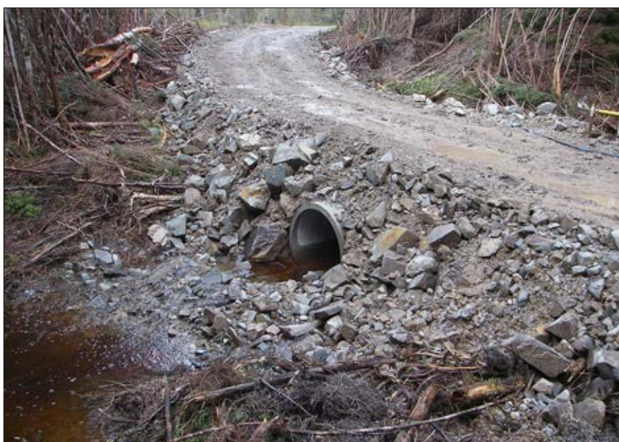
Well constructed concrete pipe culvert.