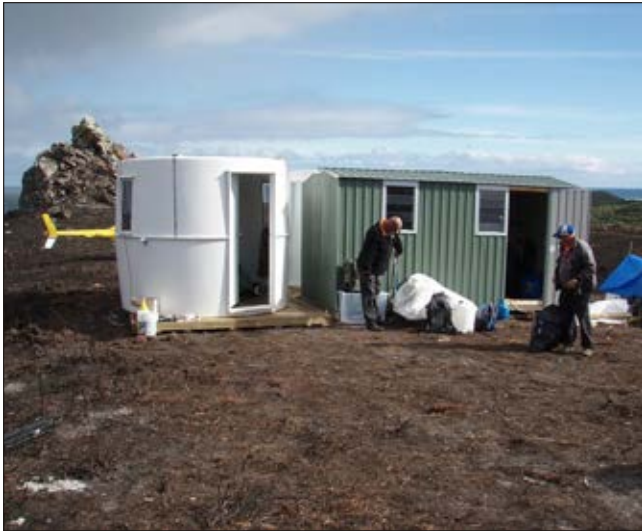
Hatted camp using converted rain water tanks as huts and a garden shed.