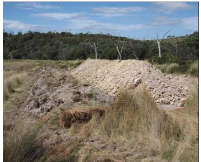
Costean at Rushy Lagoon showing topsoil and gravel stockpiles.