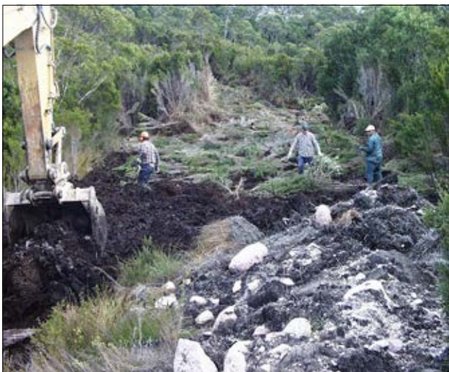
Spreading tea tree slash on drill access track.

On the whole, the use of fertiliser, especially in small amounts, is preferred to non-use. Use a fertiliser such as the off-the-shelf 8:4:10 or 6:5:5 plus magnesium mix, at a rate of no more than 250 kg/ha. At a rate of 250 kg/ha, one kilogram of fertiliser will cover 40 m 2 . One handful (approximately 100 g) will cover four square metres.