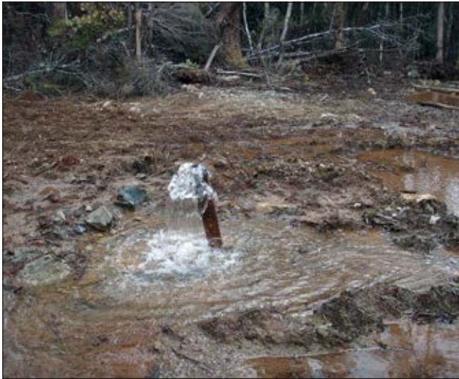
Drill hole making water.