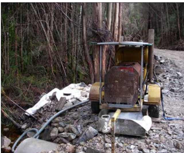
Roofed pump, fuel tank and bund.