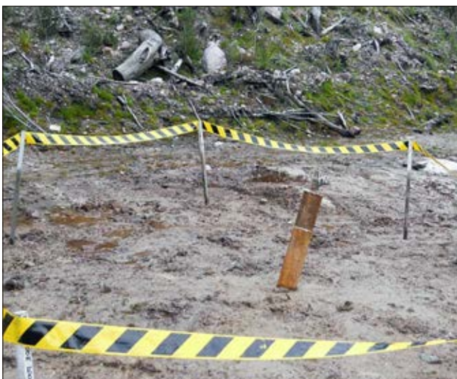
Three attempts to seal hole with eventual success at great cost. Note no solid secure collar.