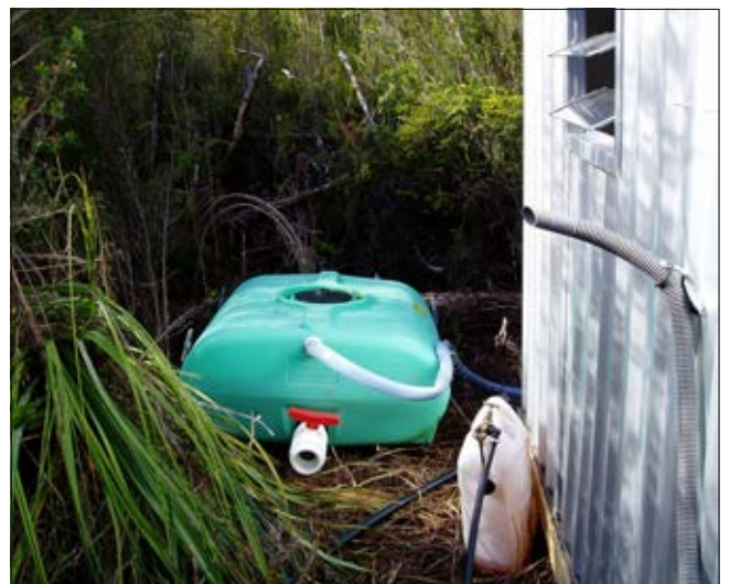
Large capacity sewage storage.