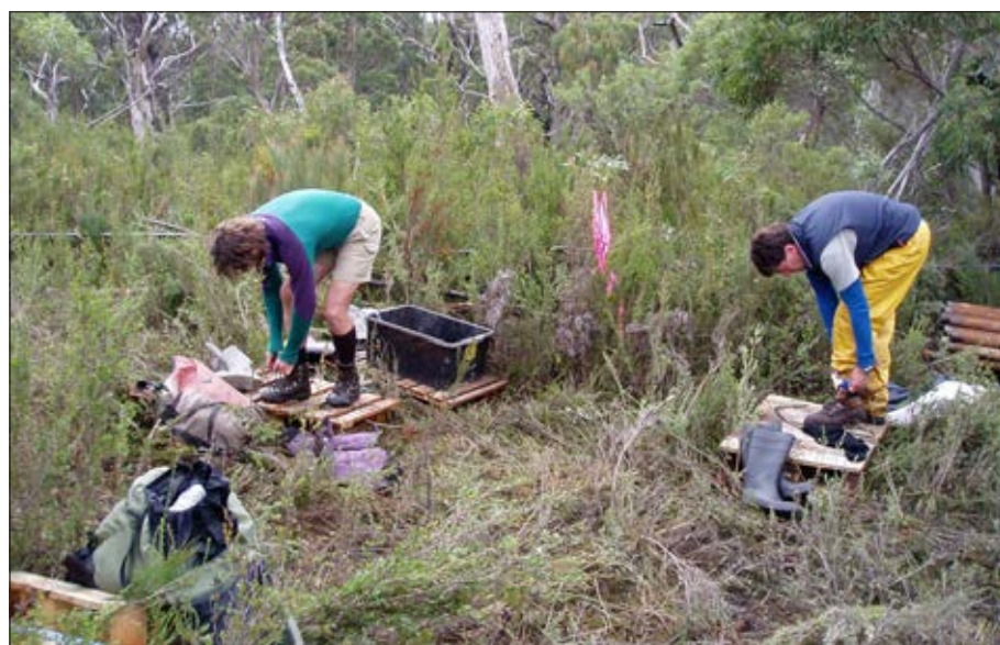
Phytophthora cinnamomi wash down station in the field.

Myrtle wilt is a natural fungal disease which kills myrtles, especially where the tree has been damaged or disturbed. It is recommended that disturbance to myrtle roots and damage to limbs and trunks be minimised to stop the spread of myrtle wilt.