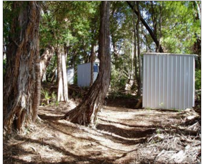
Garden sheds as individual bedrooms.