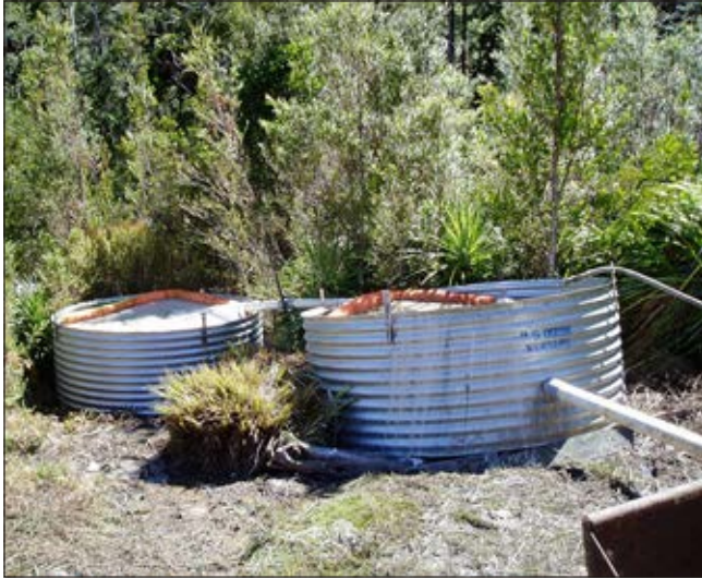
Excellent example of remote area above ground sumps — note oil absorbent mat and sausage.