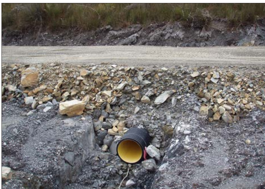
Note rip rap in discharge area and good foundation.