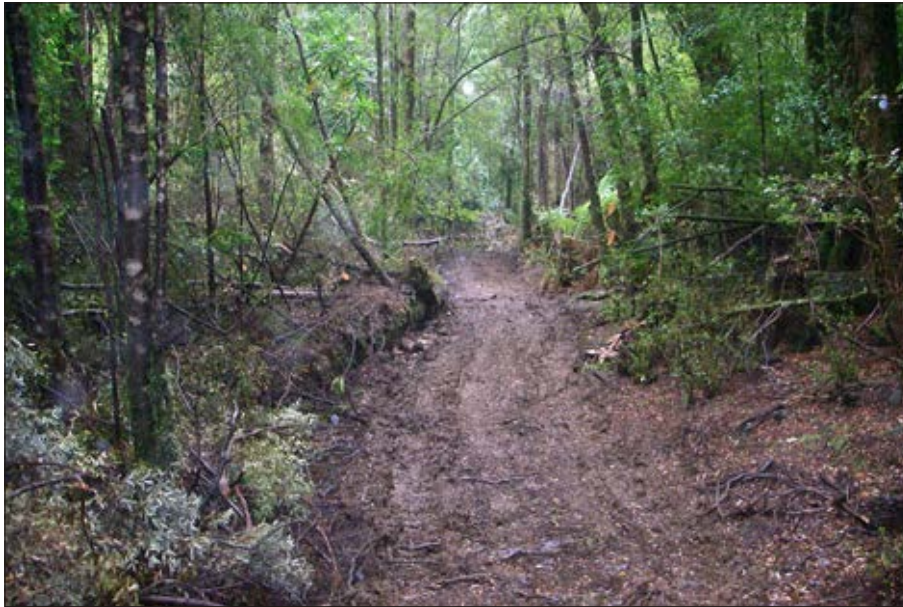
ATV track developed to access a drill site.

moderate slopes or short term drill tracks accessed by tracked vehicles.