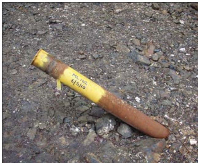
Steel collar — secure, sealed, but number will fade.