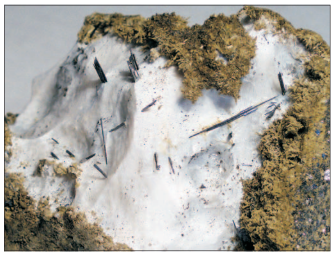
4. Aikinite needles in calcite, Kara mine

Albite occurs very commonly as a rock-forming mineral in the Cambrian and Precambrian igneous and metamorphic rocks of western Tasmania. It is common in some syenitic porphyries in the Cretaceous Cygnet alkaline complex (including the varieties oligoclase and andesine; Ford, 1984). 'Albitites', composed mostly of albite and of uncertain origin, are abundant in the Savage River mine.