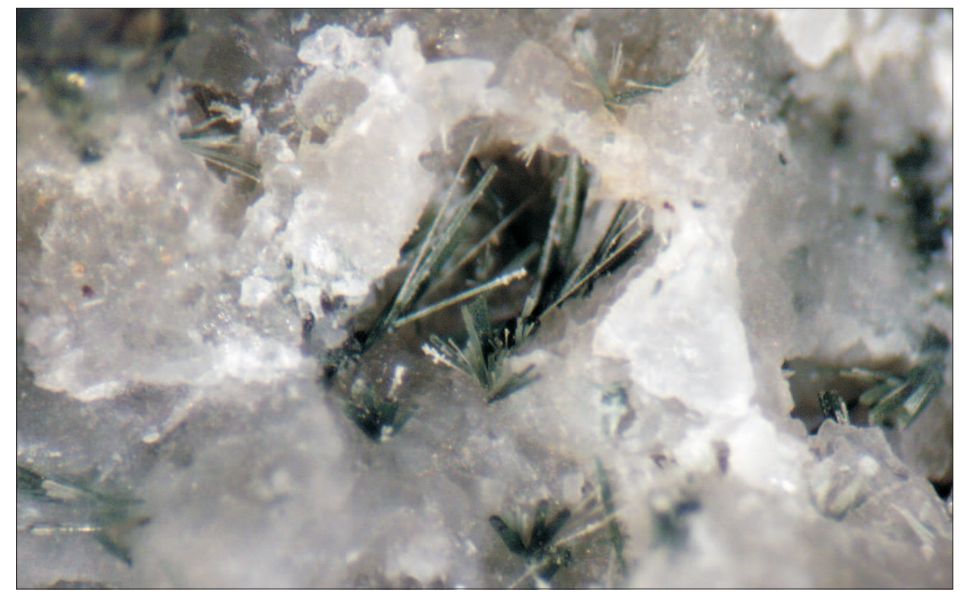
3. Aegerine, Interlaken

Microscopic acicular brown crystals in hornfelsed xenoliths in basalt on Dogs Head Tier at Interlaken, optically appear to be this rare mineral. They occur with sanidine, quartz, aegirine(?) and augite. This requires confirmation.