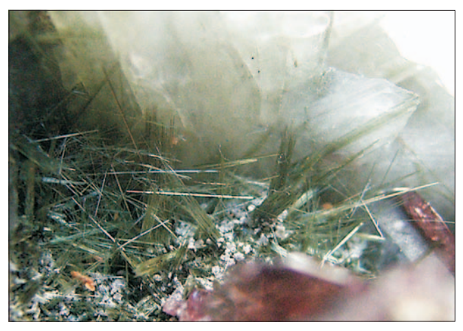
2. Actinolite on axinite-(Fe) with calcite, Colebrook Hill mine

Actinolite was also previously reported at: