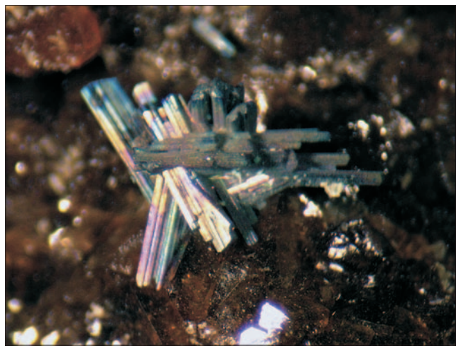
5. Aikinite needles on andradite, Kara mine

Analyses are reported for albite in Precambrian amphibolites in the Savage River–Pieman River area (Turner and Bottrill, 2001) and in skarns at the Kara mine, Hampshire (Bacon and Bottrill, 1988). Albite is abundant in many of the granites of northeastern Tasmania, particularly as rims on more calcic plagioclase (McClenaghan et al. , 1982, 1992).