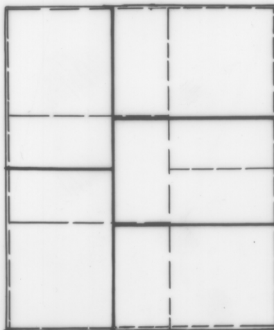
5 CASE STACK