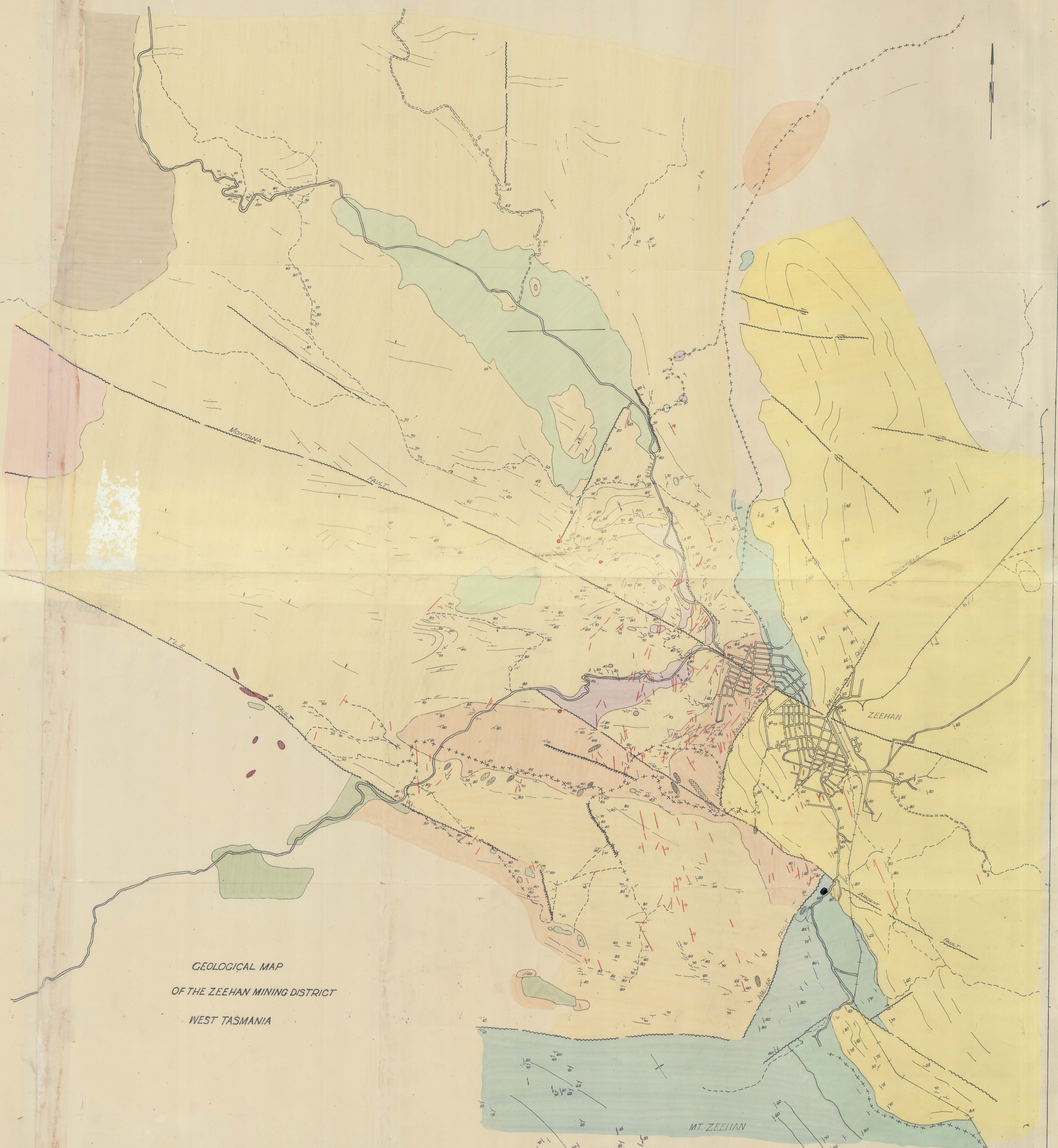
GEOLOGICAL MAP OF THE ZEEHAN MINING DISTRICT WEST TASMANIA

Topographic Base From Lands & Survey Dept zeehan plans Zeehan Sheet