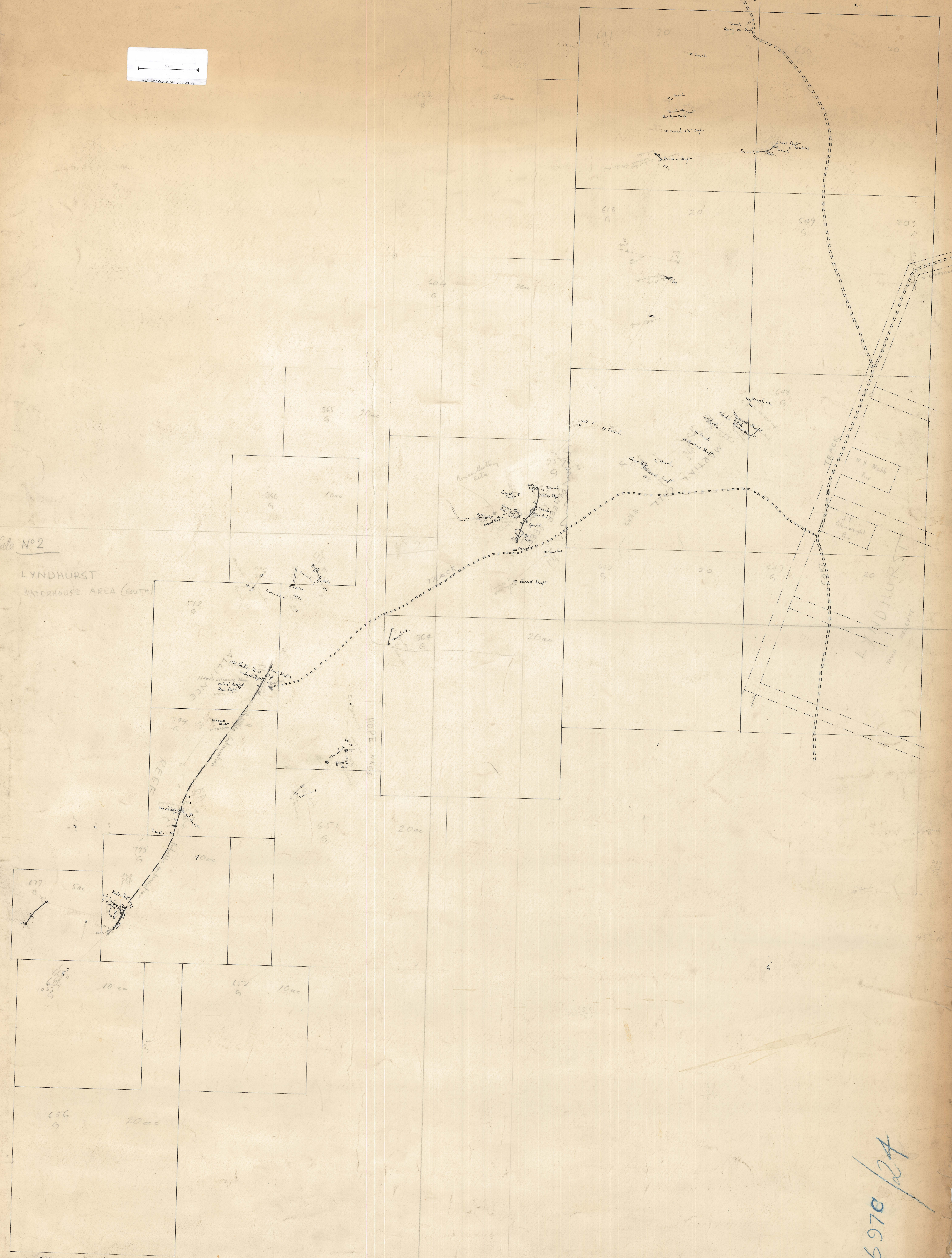
Plate No 2 LYNDHURST WATERHOUSE AREA (SOUTH)