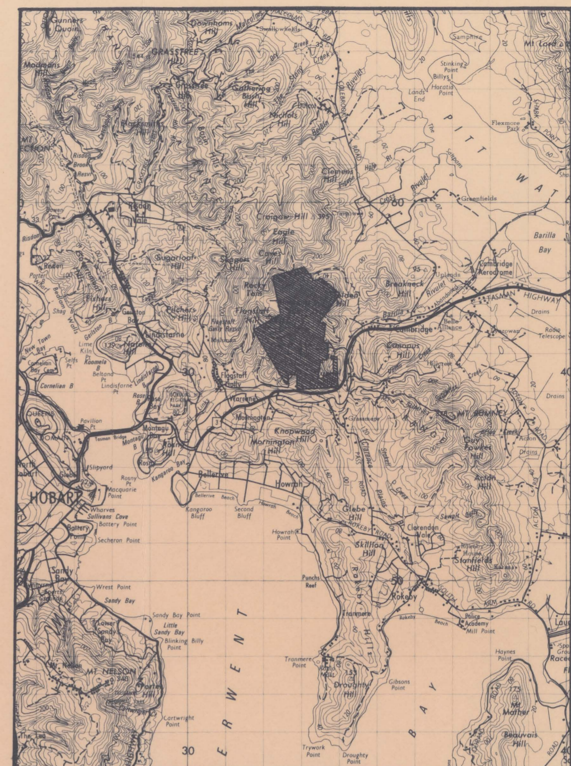
— LOCALITY MAP —