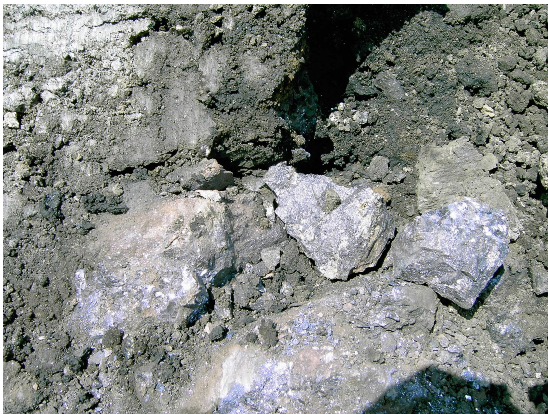
Photograph 6: High-grade Zinc-Lead-Silver ore