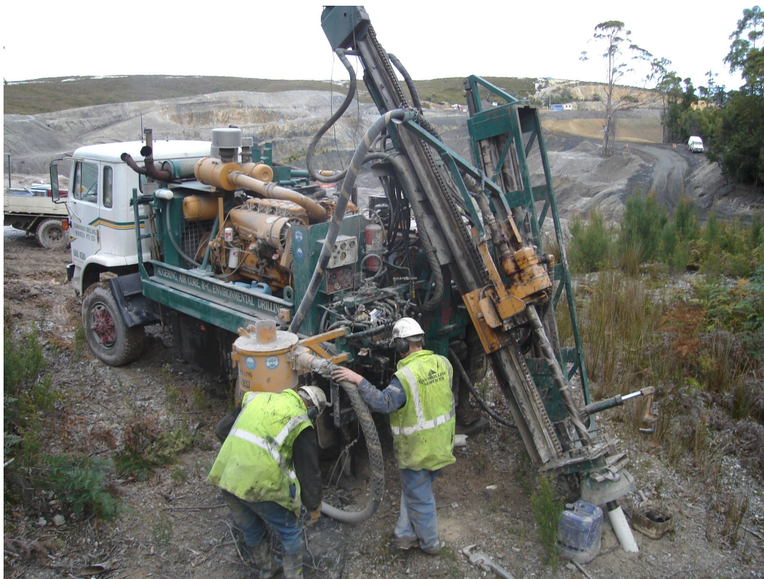
Photograph 8: Drilling of Main Lode, Comstock Mine