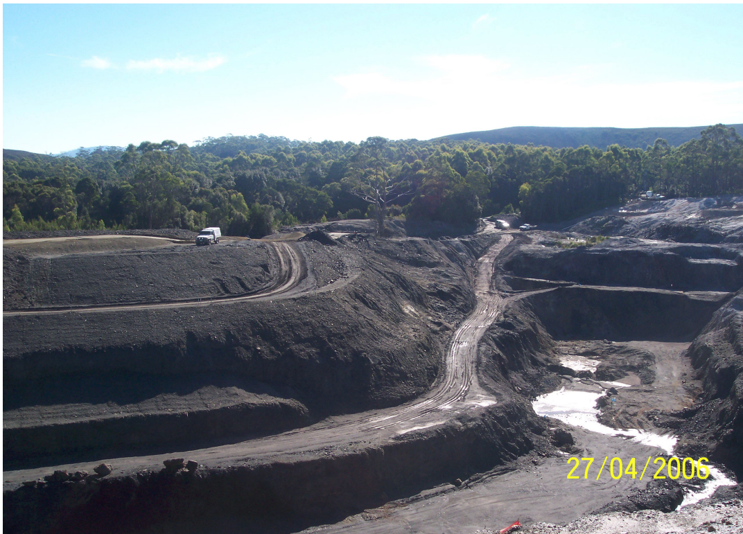
Photograph 12: Proposed Comstock Creek diversion from main adit (beneath all the historic Comstock workings) to the disposal area.