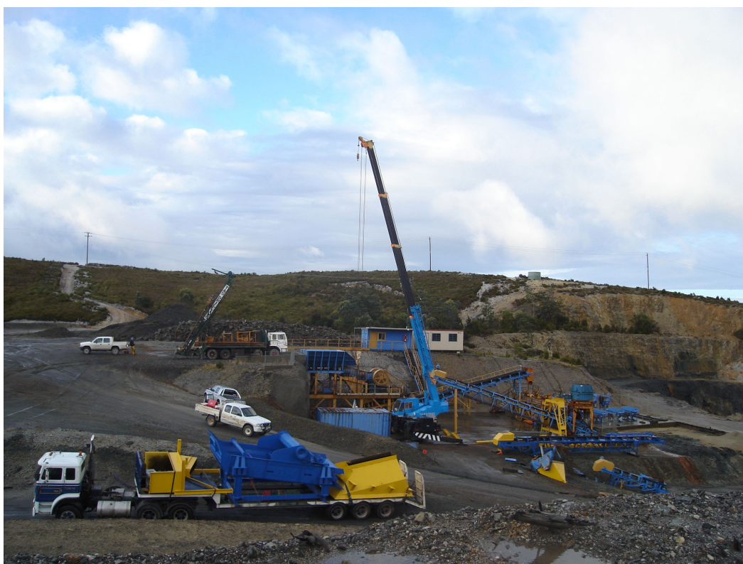
Photograph 4: Panoramic View of the Comstock Mine