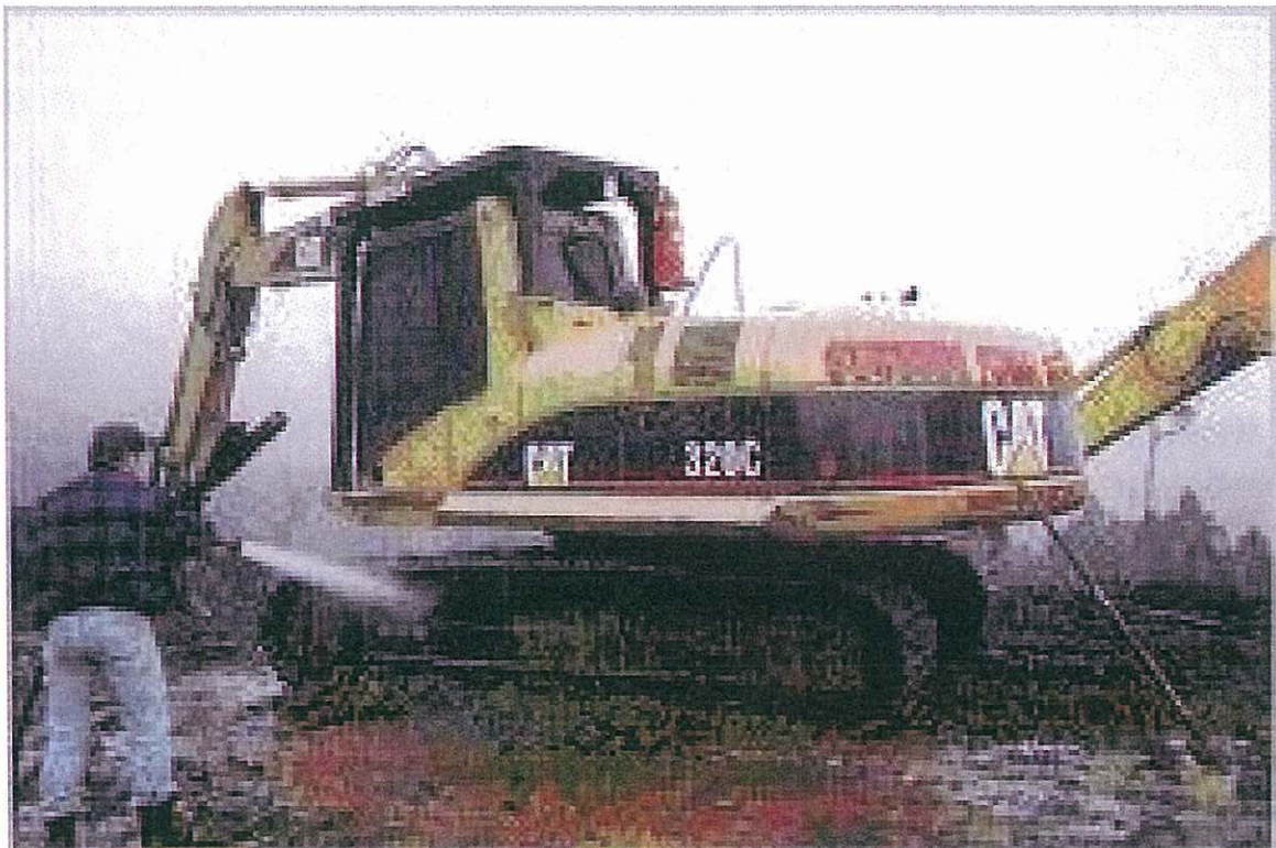
Figure 2 Washing down

Mark or record washdown sites with the landowner or manager for subsequent monitoring and weed control.