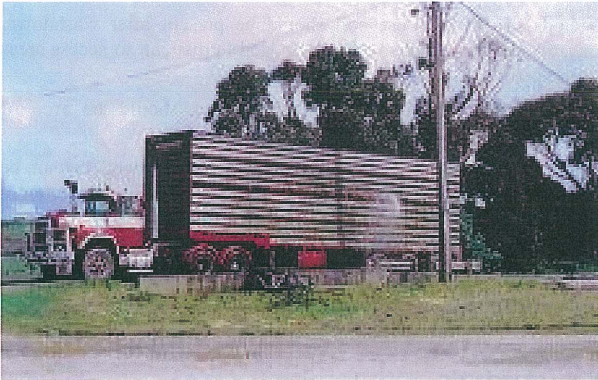
Figure 1 Smithton truckwash in action

Purpose built wash bays should be used when ever possible. These washdown facilities include effective effluent management systems to protect the environment. Commercial washdown facilities are available for vehicles and small trucks at most large towns.