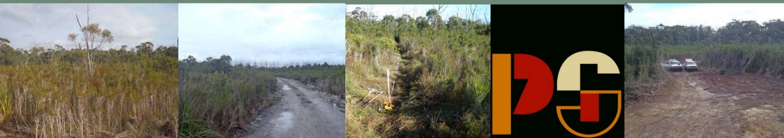
Images of Nelson Bay River mine site

transport infrastructure | community infrastructure | industrial infrastructure | climate change