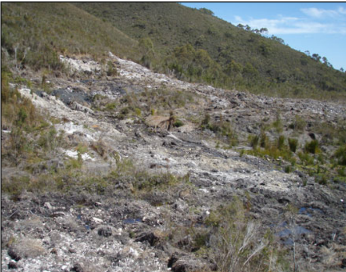
Plate 3. The auguring area pictured is the largest and most visible disturbance from the Henty Road.

The timing of rehabilitation is planned for late summer 2008 but is dependent on a planned burn to be carried out by Parks and Wildlife in the area. As per Plates 3-5 jute will be laid onto the ground with native seed bearing slash spread across it taken from the immediate area. Access to affected areas with equipment, jute etc will be via quad bike.