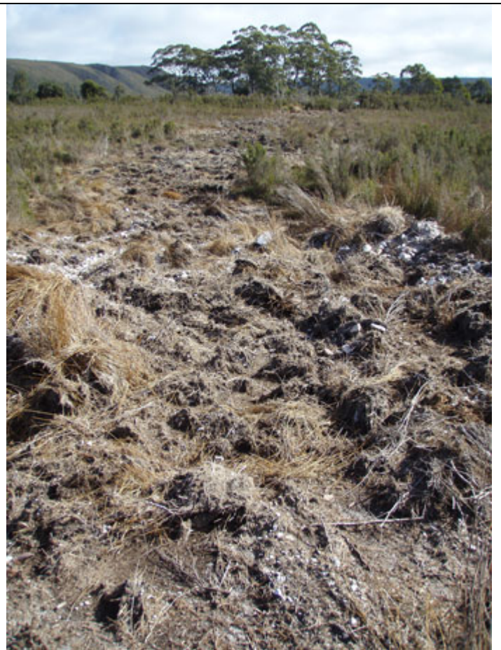
Plate 2. Access route to IPD005 used by the Drill Rig and "Bombadier" after rehabilitation.