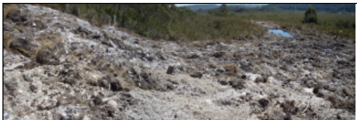
Plate 5. The above auguring site viewed looking west