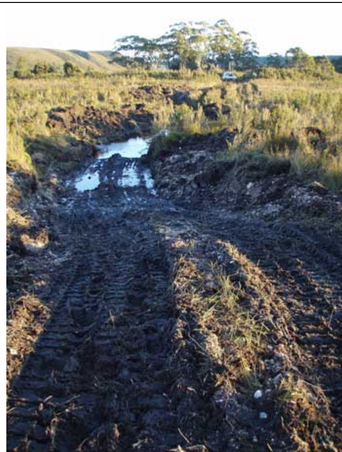
Plate 1. Access route to IPD005 used by the Drill Rig and "Bombadier" prior to rehabilitation.

*NB: As part of the vegetation management of the Grieves area Parks and Wildlife plan to burn the valley in late summer delaying the planned laying of jute and slash.